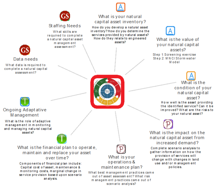
Figure 3: The MNAM methodology focuses on the unique or novel considerations required for municipal natural capital and their associated services.

The Guidance Document provides information to support hydrologic modelling related to: