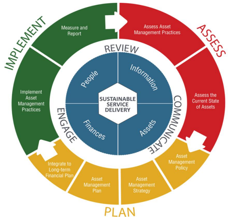
Figure 1: Asset Management is an integrated process that helps local governments make informed decisions that support sustainable service delivery. Source: Asset Management BC.

Canadian local governments are seeking new strategies to improve their ability to deliver core services in an affordable, financially sustainable manner. Many have turned to modern Asset Management to achieve this. Asset Management involves inventorying a community’s existing assets, determining the current state and value of those assets, and preparing and implementing asset management plans to maintain or replace those assets, with the goal of ensuring sustainable service delivery to a community. Asset Management requires that municipalities take a lifecycle view of assets which can, amongst other things, help predict asset failure, plan for replacement strategies and effectively time funding requirements (based on Asset Management BC, 2013). Canadian municipalities are now required to adopt modern asset management approaches as a result of measures including the 2009 Public Sector Accounting Board (PSAB) standard 3150 that includes a provision for municipal tangible capital assets to be identified, counted, valued and amortized over their useful lifetime 3 .